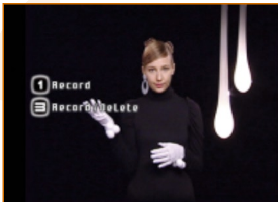
Sample Video IVR service